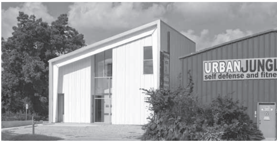
Front façade showing pre-engineered structure and vertical siding.